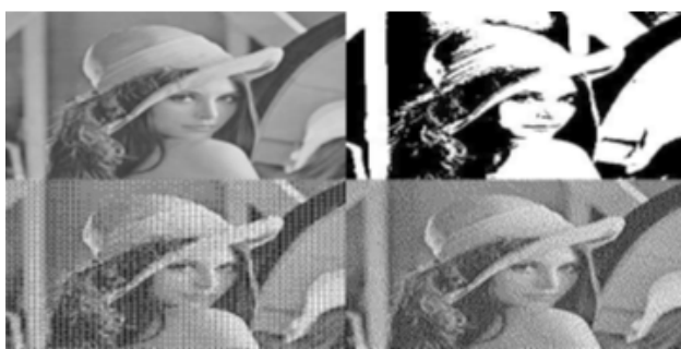
Figure 2: Image Conversion Facilities of Prima Toolkit.

Down-sampling of a grayscale image: with constant threshold, with the threshold matrix, with error distribution.